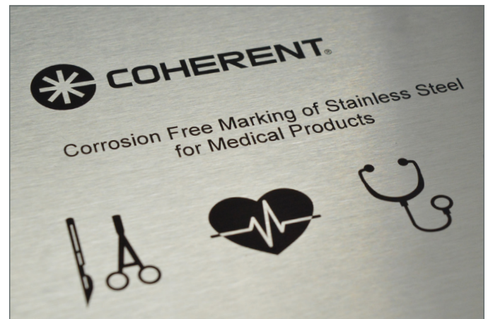
Figure 2. Black marking creates high contrast permanent marks in stainless steels such as this 1.4301 example.