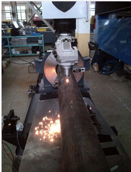
Figure 2. This application requires a multi-kilowatt laser to achieve target throughput rates.

Laser cutting of these slots was first adopted a number of years ago as an alternative to sawing and milling. However, the thickness of the steel and the number of slots dictates the use of several kilowatts of CW laser power in order to achieve an economically competitive process throughput. And for many years there was no simple way to integrate a CW laser that could cost-effectively deliver this performance along with the necessary beam quality, 24/7 capability, and minimal maintenance requirements.