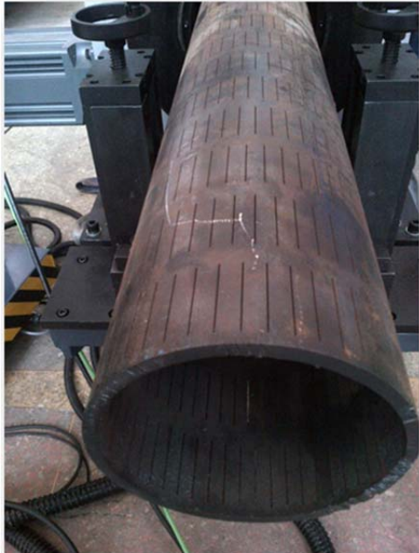
Figure 1. Slotted liners used for heavy oil production incorporate thousands of slots that must be cut to specification.

The slotted liners are expected to last the lifetime of the well, which can be many years. In order to withstand pressure and abrasion over this period, they are typically fabricated from steel tubing with a 10 mm wall thickness. Tube diameter ranges from 20 to 30 cm, and the lengths range from 5 to 12 meters. Fortunately, rusting is not a significant issue in the anoxic environment in an oil well, allowing the use of mild steel.