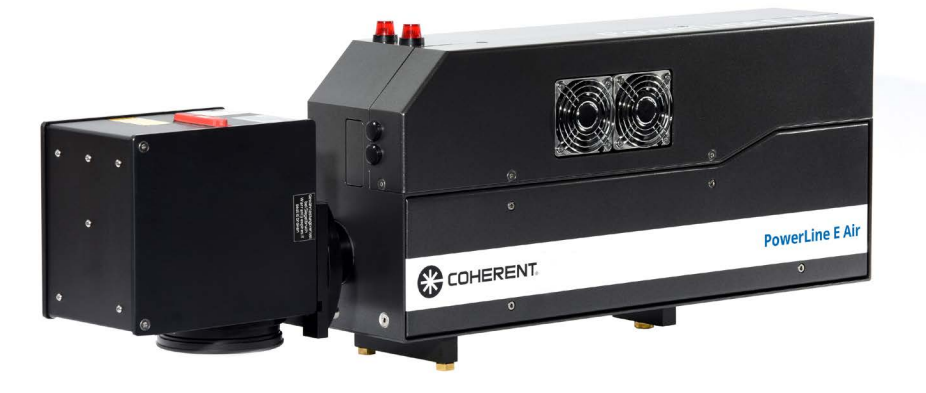
Figure 3: The Coherent PowerLine E Series are flexible laser markers that can be configured with diode-pumped solid-state lasers having output at 1064 nm, 532 nm, or 355 nm. They are intended for applications that require marks with excellent legibility and high production throughput. This application utilized a laser marker with 40 W of IR output.

The process speed requirement was addressed utilizing multiple laser markers in each marking station which operate simultaneously. Systems incorporating either four or six laser markers were made for the particular end user in this application. This approach allows simultaneous marks to be made around the entire circumference of the part, in a single operation, without any part rotation or movement.