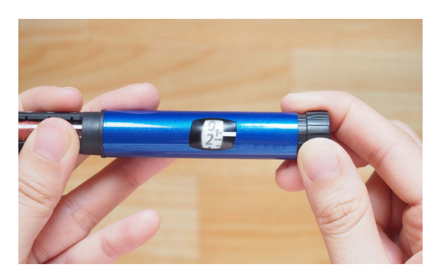
Figure 1. The user twists a knob on the pen to select their dosage. It is essential that the administered dosage is accurate.

Several marks must be placed around the circumference of this part with high spatial accuracy in order to ensure correct dosing.