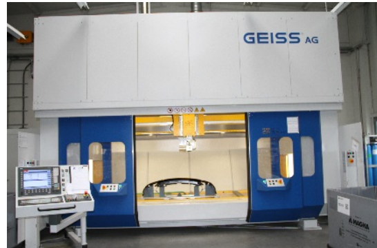
The large working chamber of the tandem system can accommodate large truck components

The Griesheim-based company, which now has 30 employees, does indeed have a considerable array of machinery: in addition to classic thermal processing stations, there are numerous milling and sawing systems as well as a 2D laser cutting station and, for the last few months now, an impressive, linear-driven 5-axis laser cutting system from the plant manufacturer Geiss AG.