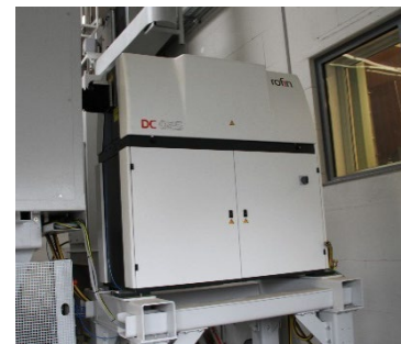
The 2.5 kW CO 2 Slab laser delivers good beam quality

"In 2013, we used a laser in the production of a truck sun visor for the first time," reports Armin Buchsteiner. "The result was so convincing that today we process 50% of all parts with the laser. We operate the new system with the diffusion-cooled CO 2 laser from Coherent, as other laser beam sources and milling produced edges that were too sharp on numerous components," explains Buchsteiner. "This laser, on the other hand, allows easy melting at the leading edge and no large burr at the trailing edge – this eliminates the need for time-consuming post-processing such as deburring, which considerably reduces costs."