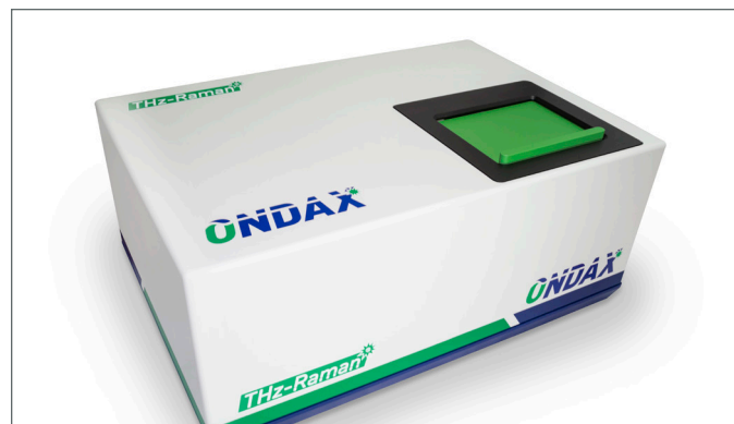
Figure 1. The TR-WPS is a fully automated THz-Raman system, designed for high-throughput screening and characterization of polymorphs and crystallinity of materials such as active pharmaceutical ingredients (APIs).

Raman, High Throughput Screening, Polymorphs, Crystallinity, Polarized Light Microscopy, Pharmaceuticals, Biopharma.