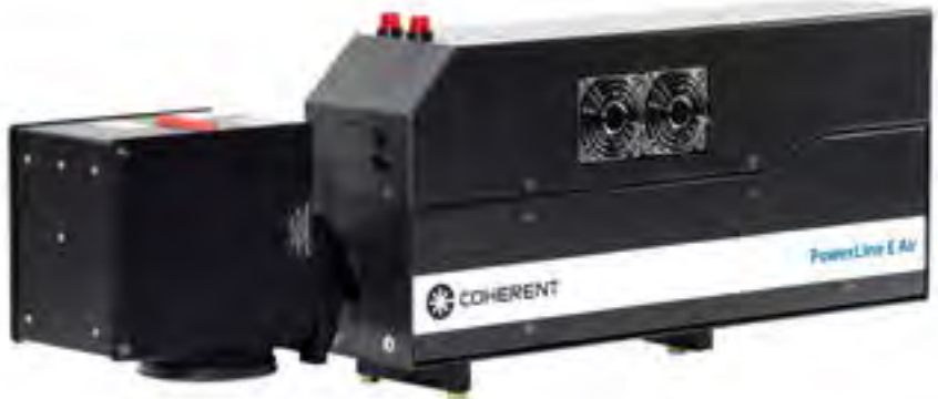
Figure 3: The Coherent PowerLine E Series are flexible laser markers that can be configured with diode-pumped solid-state lasers having output at 1064 nm, 532 nm, or 355 nm. They are intended for applications that require marks with excellent legibility and high production throughput. This application utilized a laser marker with 40 W of IR output.

The process speed requirement was addressed utilizing multiple laser markers in each marking station which operate simultaneously. Systems incorporating either four or six laser markers were made for the particular end user in this application. This approach allows simultaneous marks to be made around the entire circumference of the part, in a single operation, without any part rotation or movement.