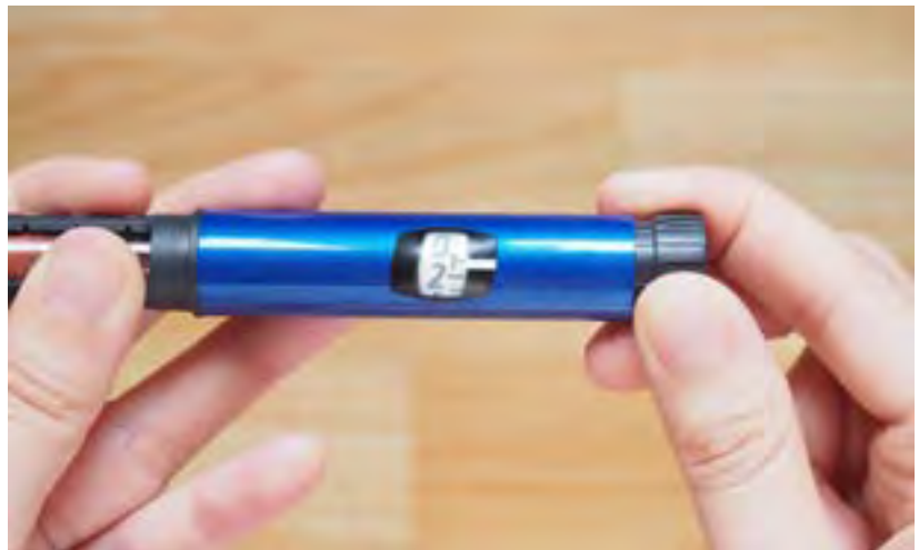
Figure 1. The user twists a knob on the pen to select their dosage. It is essential that the administered dosage is accurate.

“Several marks must be placed around the circumference of this part with high spatial accuracy in order to ensure correct dosing.”