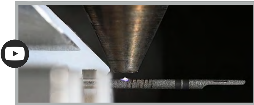
Figure 2. Cutting slots on a tubular component to enable flexible delivery.

Comerford adds that the company has always worked closely with their customers in developing custom and standard products based on delivering the highest levels of performance in terms of torque, trackability, flexibility, lubricity, inflate and deflate times etc. In addition to catheter shafts, Cambus Medical also produces many high-precision, micro component solutions and specialty needles through its Velona program and wire assemblies utilizing the impressive range of laser and non-laser technologies employed within the business.