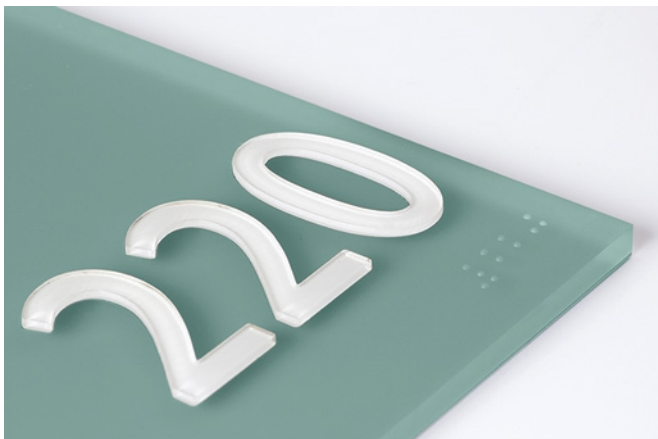
Figure 2: Polished edge

In contrast, the laser is a non-contact tool that cuts by essentially melting and vaporizing away material. Typically, plastic cutting is performed using the CO 2 laser because its infrared output is strongly absorbed by most organic materials, even those which appear transparent in the visible (such as many acrylics). From their experience, Intersign has found that laser cutting: