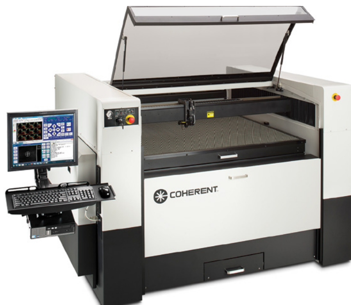
Figure 4: META 2C