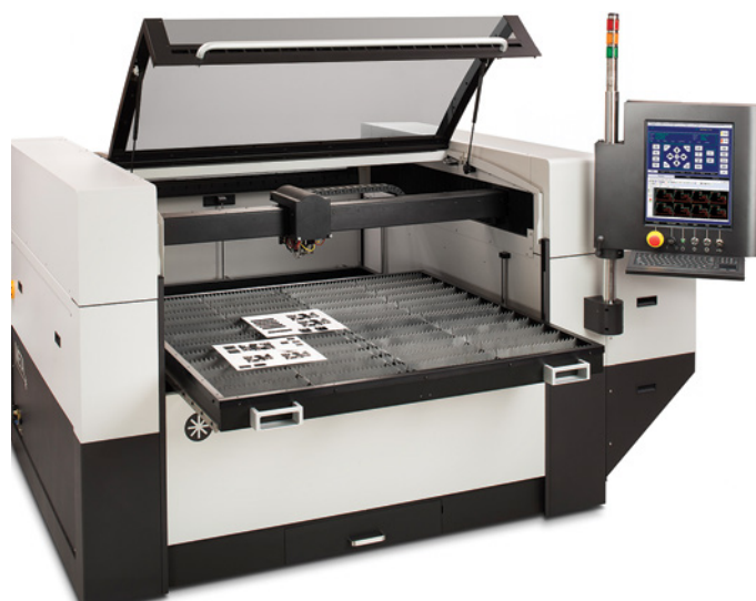
Figure 3: META 10C

The sealed CO 2 laser technology offers nearly 50-percent greater inherent electrical efficiency than the fast flow lasers commonly found in most other laser machine tools, making them economical to operate. Furthermore, sealed CO 2 lasers eliminate most of the costs associated with gas consumption