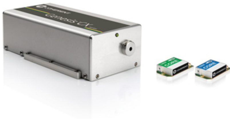
Figure 3: Coherent produces OPSLs over a wide range of powers from the tiny milliwatt level OBIS Core lasers for instrumentation OEMs to the multiwatt Genesis series.

A major reason why the performance of many legacy lasers degrades over time is loss of cavity alignment. Repeated natural thermal cycling and the long-term impact of ambient vibrations and handling shocks can cause laser cavity optics to shift. At a minimum, this can result in compromised mode quality, such as a TEM00 laser degrading to a multimode output beam. It can also result in power degradation, and in the worst case, this can prevent lasing altogether. Historically, such shifts were corrected by the end user or service engineer “tweaking” the optic(s) back into proper alignment. Laser manufacturers like Coherent realized long ago that this was not a viable or acceptable solution in modern applications, particularly where the laser is buried in an OEM instrument. We use two of our time-proven solutions in our OPSLs to eliminate misalignment as a failure mechanism.