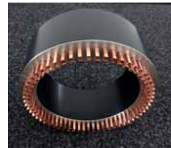
Unprocessed copper stator

Coherent | ROFIN also offers practical, process-related tools that improve results in laser hairpin welding in a production environment. For example, the company can supply a laser welding subsystem that includes a visual system to control the relative positioning of the focused laser beam and the pins.